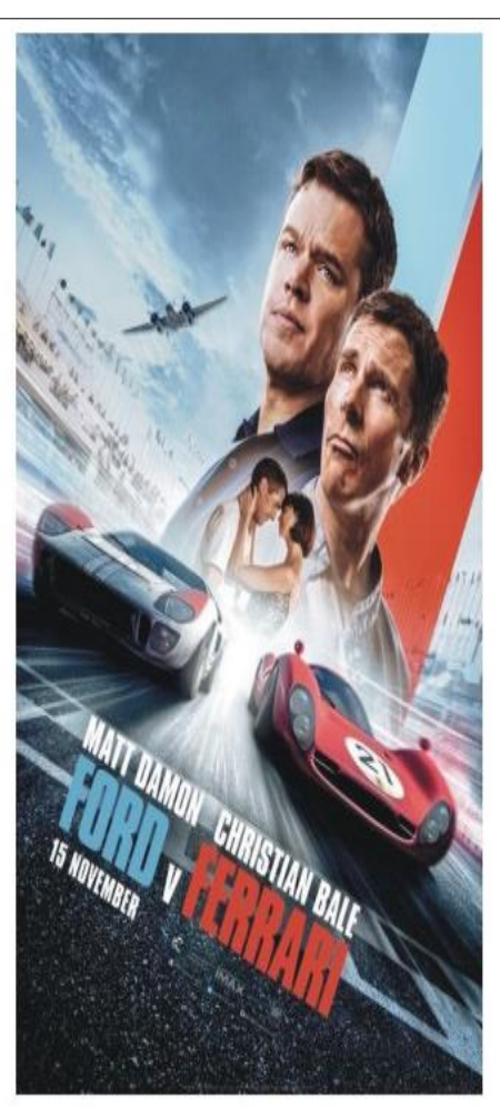
7 PM - PG 152 m