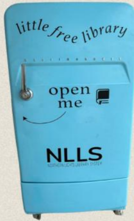
Little free library June 2 -16