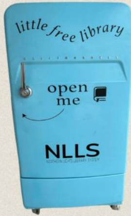
Little free library June 2 -16